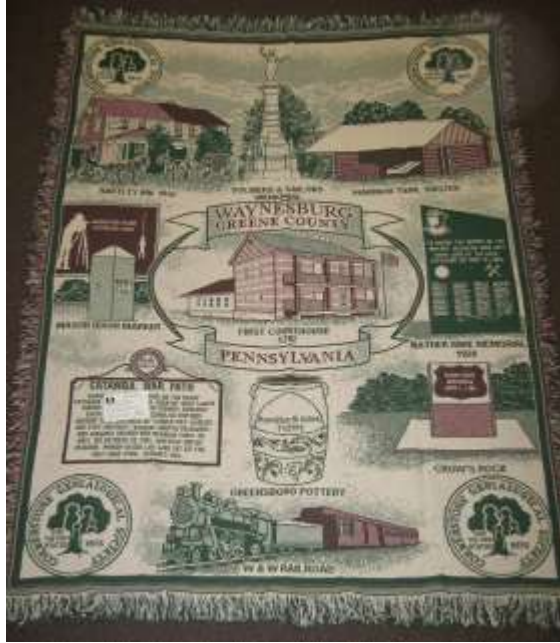
Tri-color Greene County Afghan

The Tri-colored Greene County Afghan features a few of the favorite sites of Greene County Pennsylvania. It is custom-designed and measures 50"x65" fully fringed. The 100% pre-washed cotton throw is woven in Hunter Green, Dry Rose, and Natural.