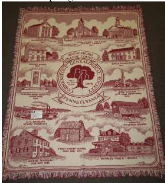
Greene County Afghan – Cranberry Red

When you purchase this easy-care item, you will receive a flyer that briefly details the history behind each pictogram.