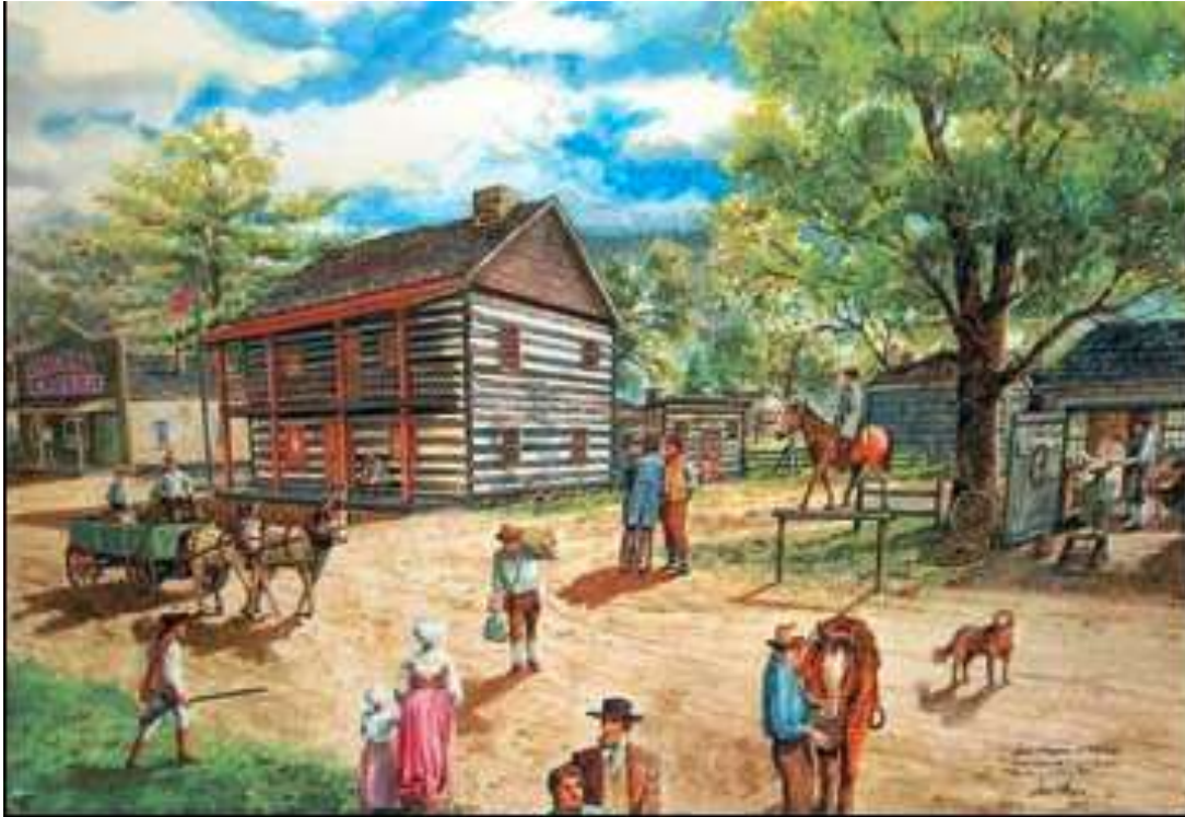
1797 Log Courthouse

Prints are available at the Cornerstone Genealogical Library. Contact the library for particular prints and sizes currently available. Prints are unframed.