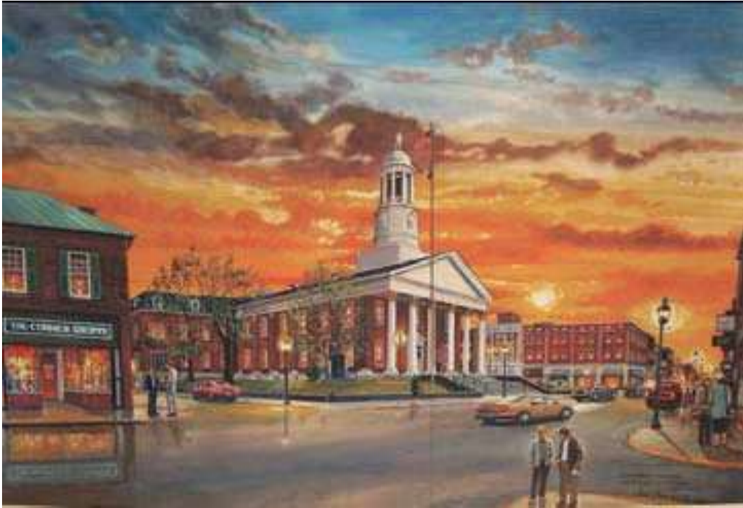
1850 Courthouse (Present Day)