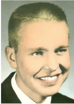
1965 high school senior (colorized)

I grew up in Coudersport, Potter Co., PA, where I graduated from high school in 1965. Then I attended Penn State. My long newspaper career began with my high school newspaper and The Potter Enterprise in Coudersport. Later I worked as an editor for Pennsylvania daily newspapers in Altoona, State College and York, and then 32 years as general manager of Collegian Inc., publisher of The Daily Collegian at Penn State. I retired in 2010.